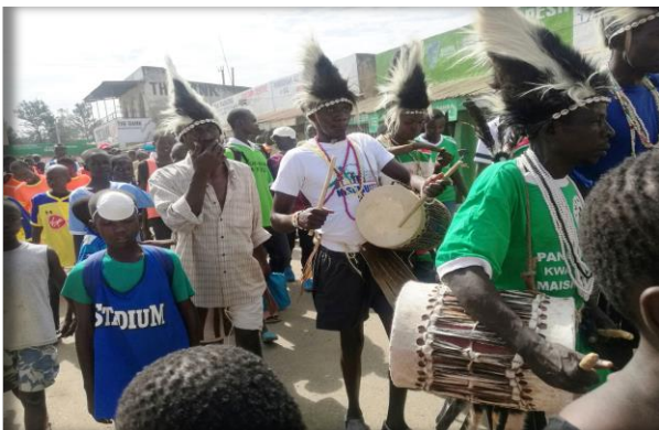
Clean up procession during the official launch of the Symbiocity Change project in Ahero